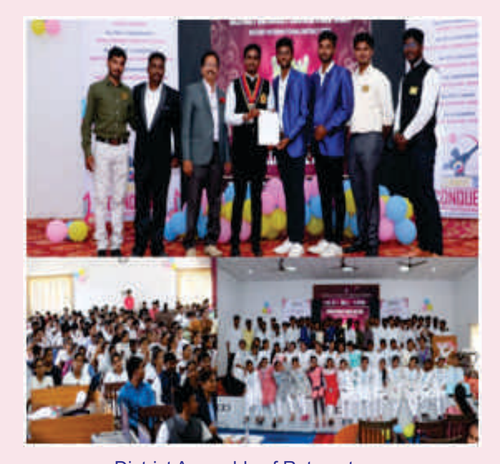
District Assembly of Rotaractors